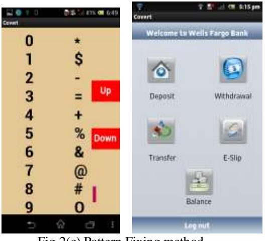
Fig 2(c) Pattern Fixing method Fig 2(d) Services of ATM F. Authentication and Services

Once the initial registration gets completed, the user gets a unique PIN number in his mail. The user can then enter the PIN number using any one of the methods mentioned above. Once entered, PIN is checked with the local database provided by Android OS using SQL Lite. A one way hash is generated for the validated PIN and is sent to server in public channel so that an active attacker cannot extract the PIN by monitoring the channel. Once got authenticated by server, the user can access to the services provided by mobile App. The services that are provided by mobile App are cash withdrawal, deposit and fund transfer. This can be done securely using the concept of virtual money.