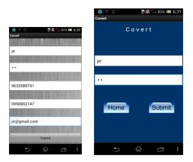
Fig 1 : User registration and login

User enters his basic details in an android application and once if he gets registered he is able to access his application in mobile phone. Once the user registration is completed, they will be provided with a unique PIN sent to their respective mail ID. Once it got validated user will be able to access application by entering username and password chosen at time of registration.